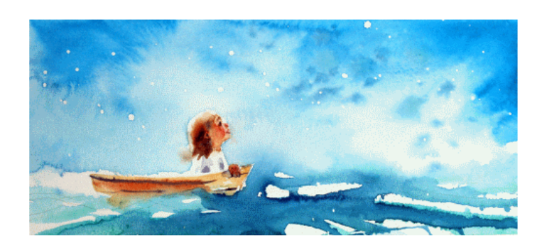
"Nothing great was ever achieved without enthusiasm." -- Ralph Waldo Emerson

Wouldn't it be ideal if we could isolate one trait in our personalities, capture it in a glass for observation and dissection? Of course this is not possible. Neither is it possible for us to isolate one part of a birth chart. The different aspects of our children's birth charts intermingle in a complex manner to make the little person that we know and love. However, it is possible for us to influence the development of our children, to support them in their journey. The aim of this section is to give vital clues for parents and mentors on how to guide, but not coerce, the development of your child.